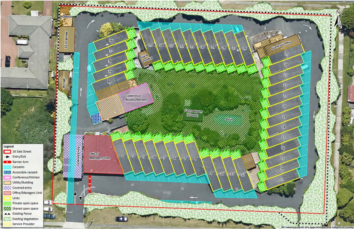
Figure 4: Site Plan