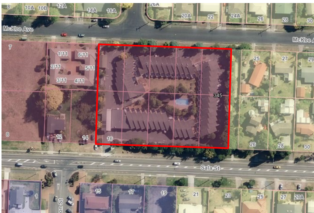
Figure 1 – District Plan zones with the subject site outlined in red. The light yellow is Residential 1 (RESZ1), the purple is COMZ4, and the lilac is Commercial 3 (COMZ3).