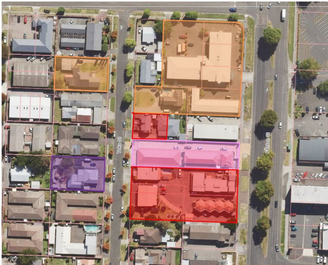
Figure 2 – Activities within the immediate surrounding environment (red – subject site, pink – other CEH site, orange – tourist accommodation, purple – childcare centre).