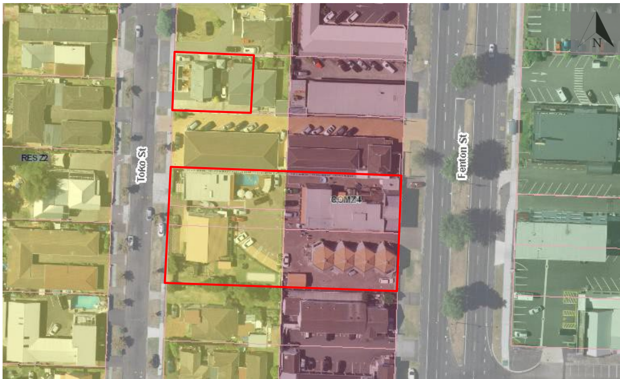
Figure 1 – District Plan zones with the subject site outlined in red. The yellow is RESZ2, the purple is COMZ4 and the green is COMZ2.