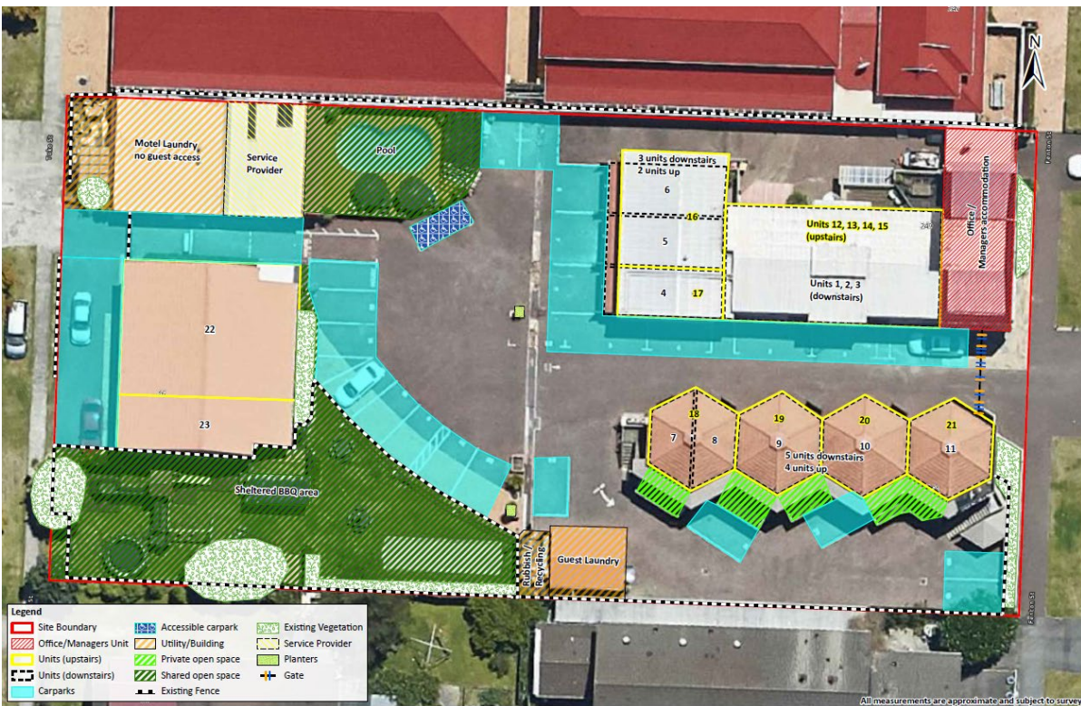
Figure 4 – Site plan showing 249-251 Fenton Street and 14-16 Toko Street